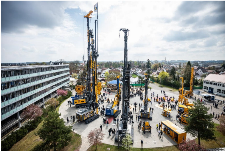
(3) From diaphragm wall to pile driving and drilling technology: Bauer presented a wide range of machines.