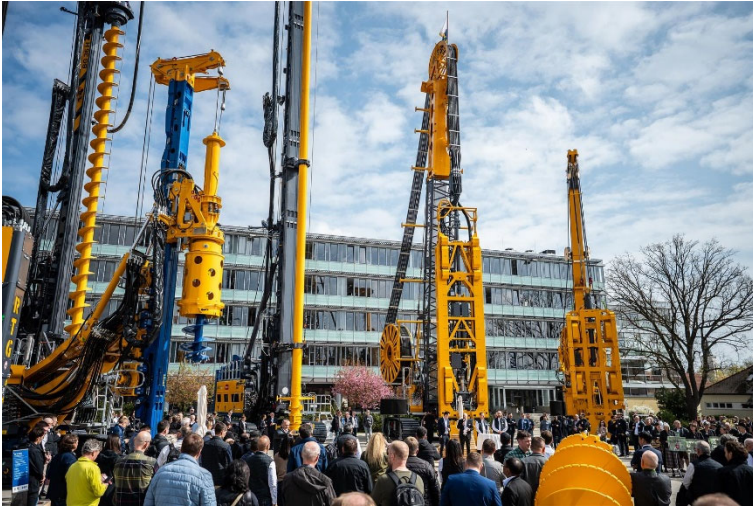
(2) Over 1,400 guests accepted the invitation from the BAUER Maschinen Group.