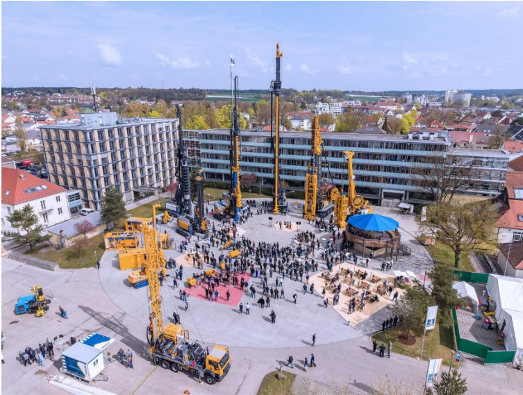
(1) BAUER Maschinen GmbH's in-house exhibition took place from April 16 to 18 in Schrobenhausen.